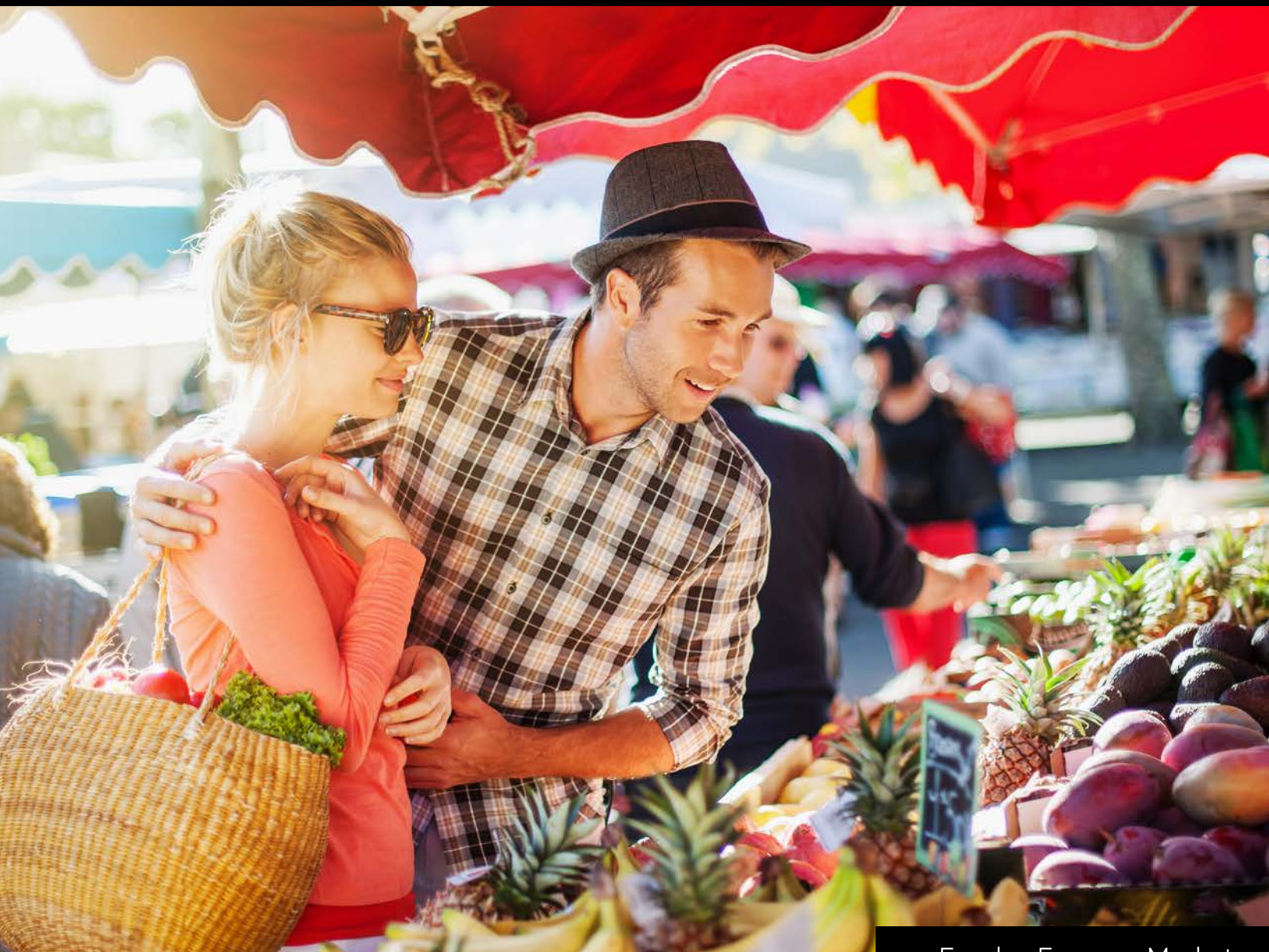
Fernley Farmers Market