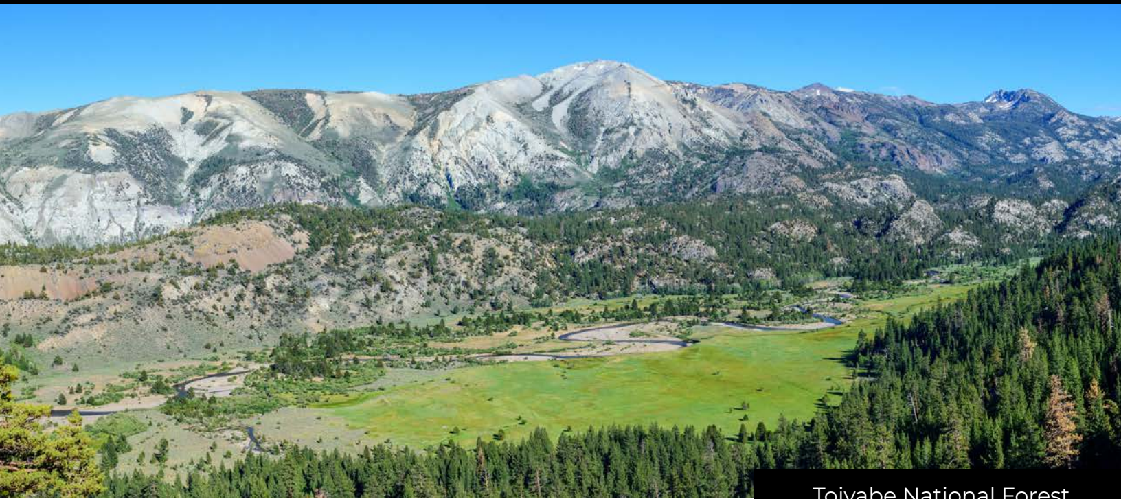
Toiyabe National Forest