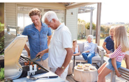
SALES CENTER ADDRESS 212 Uxbridge Dr • Sparks, NV