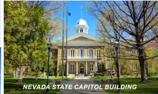
NEVADA STATE CAPITOL BUILDING