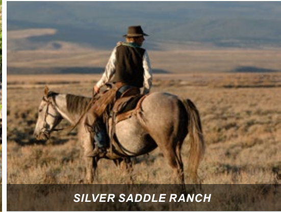
SILVER SADDLE RANCH