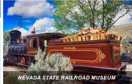
NEVADA STATE RAILROAD MUSEUM