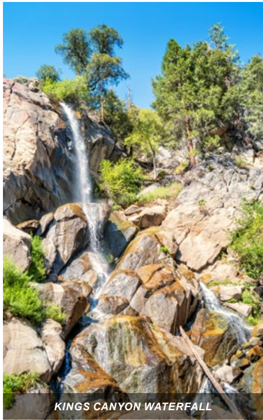
KINGS CANYON WATERFALL