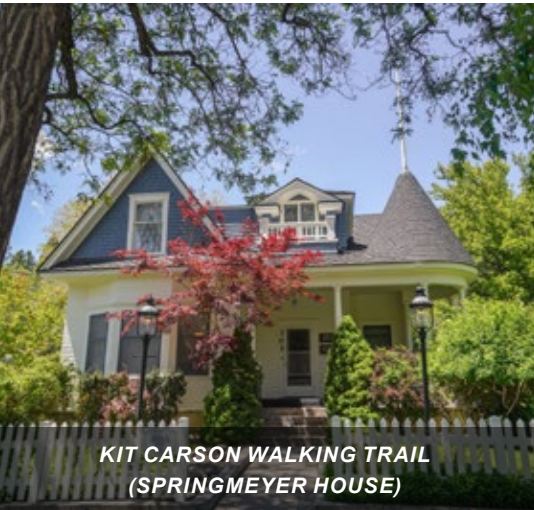
KIT CARSON WALKING TRAIL (SPRINGMEYER HOUSE)