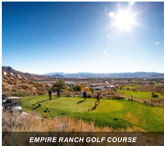
EMPIRE RANCH GOLF COURSE